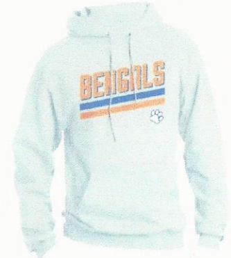
GRAY HOODED SWEATSHIRT

Please indicate quantities and total prices below: